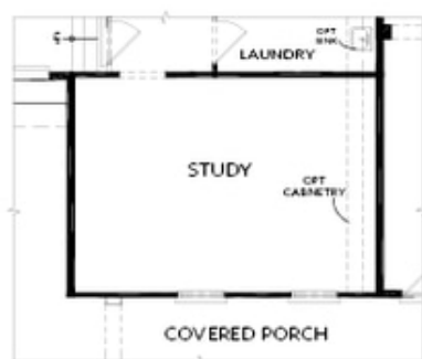
OPT Study ilo 1-Car Garage