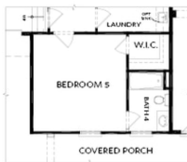
OPT Bedroom 5 ilo 1-Car Garage