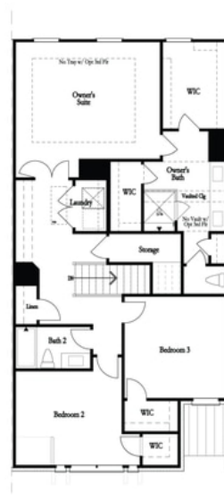
Second Floor (Owner's Rear)