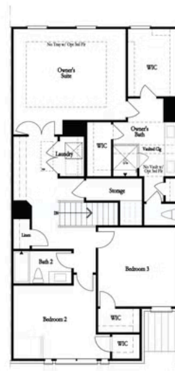
Second Floor (Owner's Rear)