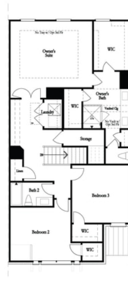
Second Floor (Owner's Rear)