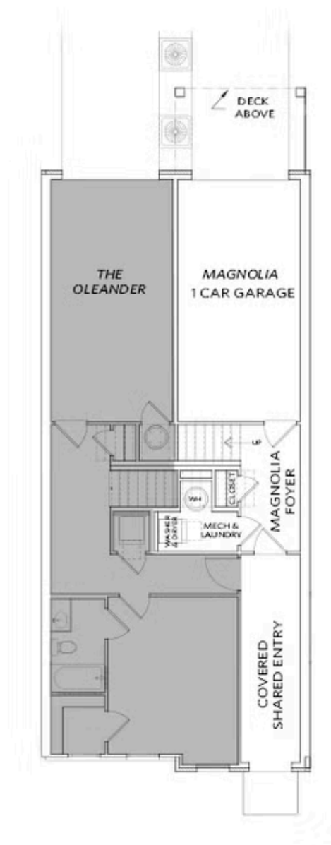
Elevations 1, 2, & 3 Interior Floor Plan Layout