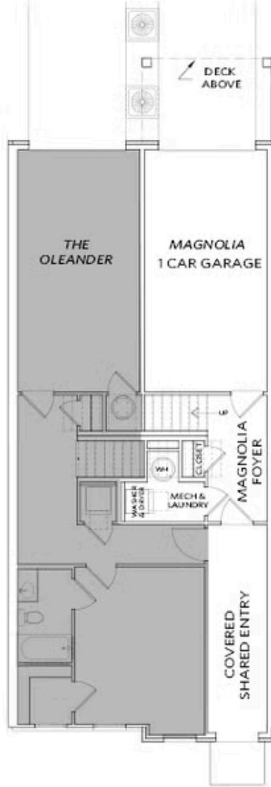
Elevations 1, 2, & 3 Interior Floor Plan Layout