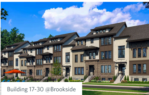
Building 17-30 @Brookside