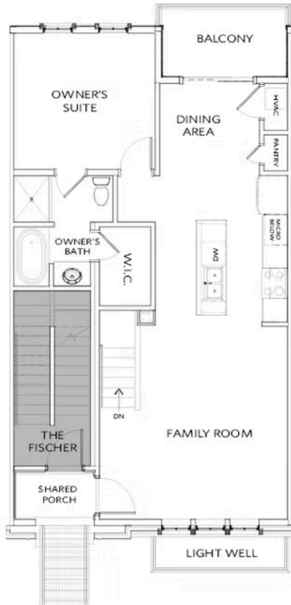
Unit A Floor Plan Layout