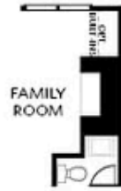
OPT Linear Fireplace