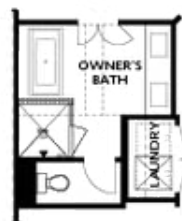
OPT Freestanding Tub/Shower Combo