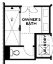
OPT Walk-Through Shower