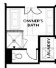
OPT Freestanding Tub/Shower Combo