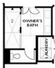
OPT Walk-Through Shower