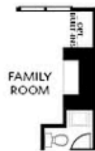
OPT Linear Fireplace