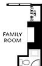
OPT Linear Fireplace