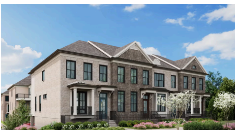
The Chamberlain at Byers Park with no Chimney