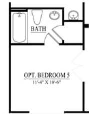
Optional 5th Bedroom ILO Living Room