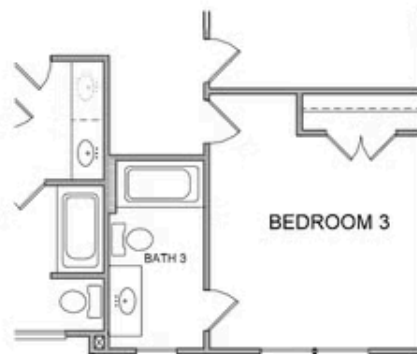
OPT BATH 3 * Elevation B ONLY