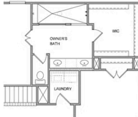
OPT WALK-IN SHOWER