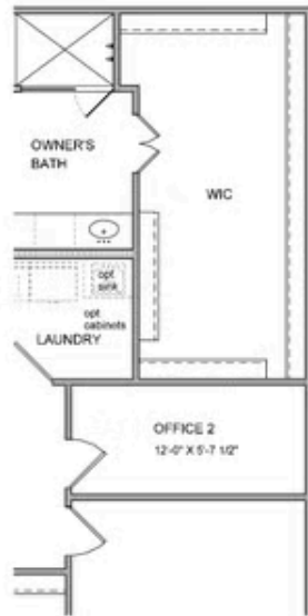
OPT OFFICE 2