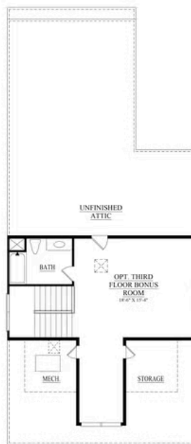
Optional 3rd Floor (for Elevation A and B only)