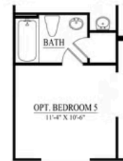
Optional 5th Bedroom ILO Living Room