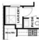
Laundry with Opt. 3rd Bedroom Only (not available with 2 bedroom layout)