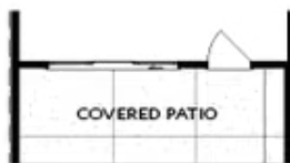
OPT Slider Door