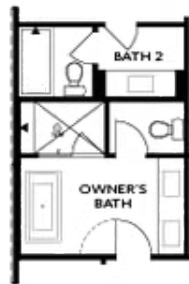
OPT Freestanding Tub/Shower Combo