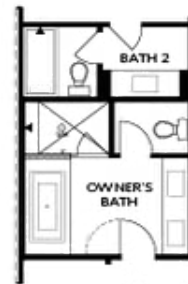
OPT Decked Tub/ Shower Combo