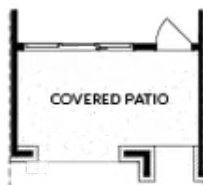
OPT Slider Door