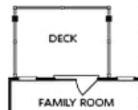
OPT Covered Deck