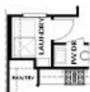
Laundry with Opt. 3rd Bedroom Only (not available with 2 bedroom layout)