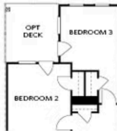
OPT Bedroom 3 on Third Floor