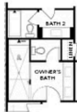
OPT Walk-Through Shower