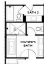
OPT Decked Tub with Seperate Shower