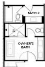
OPT Freestanding Tub with Seperate Shower