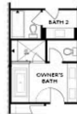
OPT Decked Tub with Seperate Shower