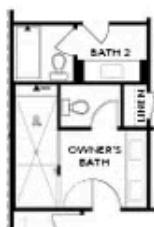
OPT Walk-Through Shower