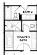
OPT Decked Tub with Seperate Shower