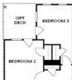
OPT Bedroom 3 on Third Floor