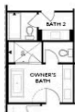
OPT Freestanding Tub with Seperate Shower