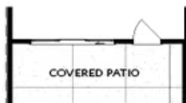
OPT Slider Door