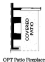
OPT Patio Fireplace