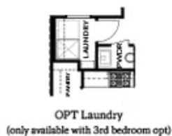
OPT Laundry (only available with 3rd bedroom opt)