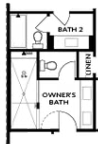
OPT Walk-Through Shower