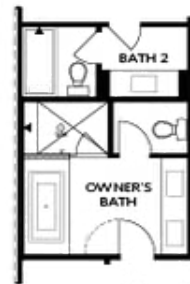
OPT Decked Tub/ Shower Combo