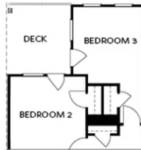
OPT Bedroom 3 - ONLY Available with Optional Sunroom