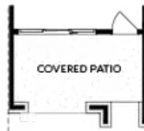
OPT Slider Door