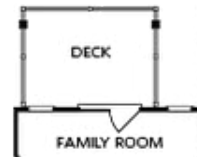
OPT Covered Deck