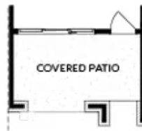
OPT Slider Door