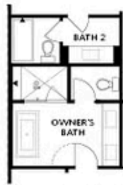
OPT Freestanding Tub/Shower