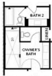
OPT Walk-Through Shower