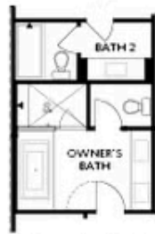
OPT Decked Tub/Shower