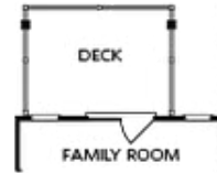
OPT Covered Deck