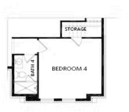
OPT Bedroom 4 & Bath 4 No Bar Area