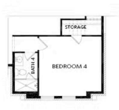
OPT Bedroom 4 & Bath 4 No Bar Area