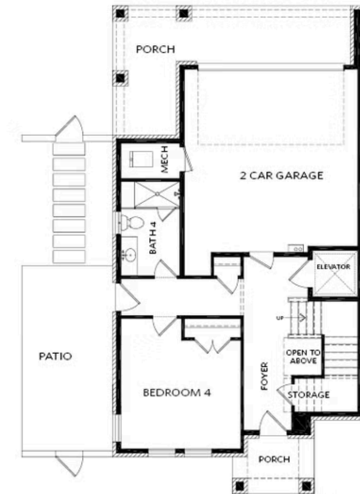
OPT Bedroom 4 w. Full Bath 4 ilo Bar Area and Powder Room