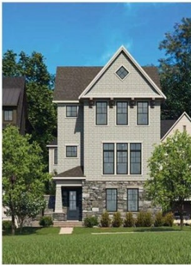
Lot 1 - Exterior Colors