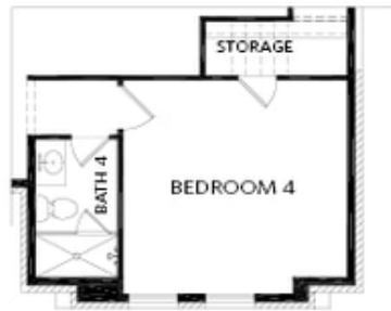
OPT Bedroom 4 & Bath 4 No Bar Area