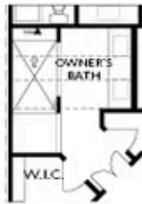
OPT Walk-Through Shower