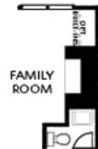
OPT Linear Fireplace