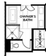
OPT Freestanding Tub/Shower Combo