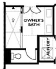
OPT Walk-Through Shower