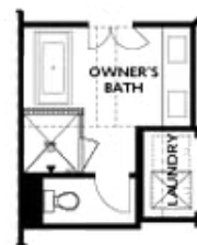
OPT Freestanding Tub/Shower Combo