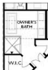
OPT Freestanding Tub w. Seperate Shower