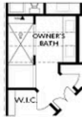
OPT Walk-Through Shower