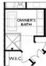
OPT Freestanding Tub w. Seperate Shower