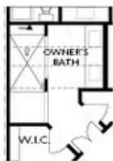
OPT Walk-Through Shower