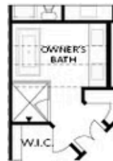
OPT Freestanding Tub w. Seperate Shower