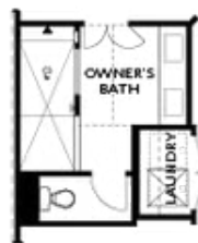
OPT Walk-Through Shower