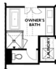
OPT Freestanding Tub/Shower Combo