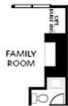
OPT Linear Fireplace