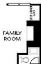
OPT Linear Fireplace