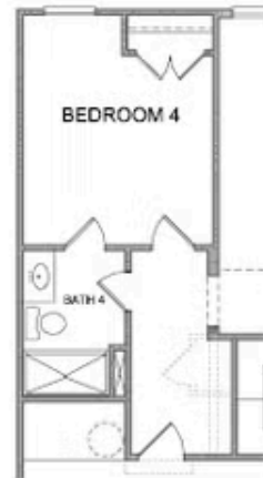
Opt. Bedroom 4 w/ Full Bath No Study & Power Room