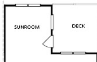
OPT Sunroom ilo Full Deck