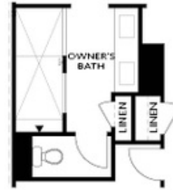
OPT Owner's Walk-Through Shower