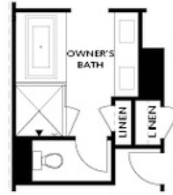
OPT Owner's Shower & Tub Combo