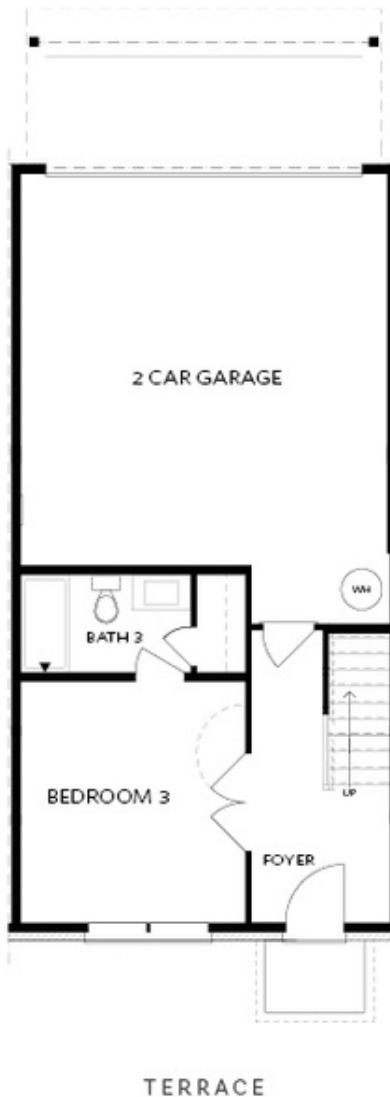
Elevations B & C Floor Plan Layout