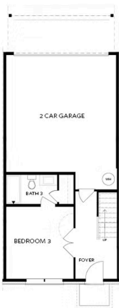
TERRACE Elevations B & C Floor Plan Layout