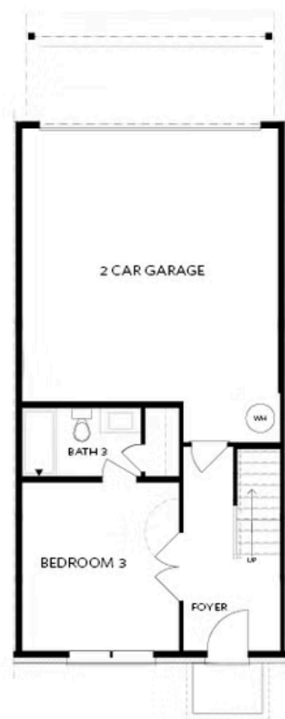
TERRACE Elevations B & C Floor Plan Layout