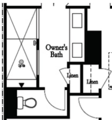
Optional Owner's Luxury Shower