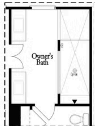
Opt. Walk-Through Shower