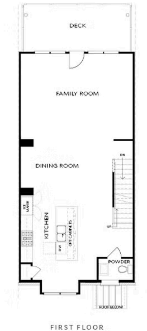
First Floor Elevations B & C Floor Plan Layout