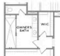
OPT Owner's Walk-In Shower