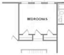
OPT Bedroom 5 ilo of Two-Story Family Room