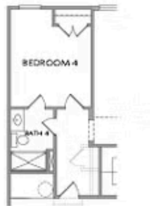
OPT Bedroom 4 w. Full Bath 4 llo Study & Powder Room