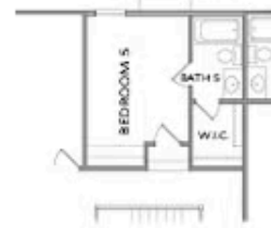
OPT Bedroom 5 w. Bath 5 ilo of Two-Story Family Room