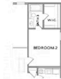
OPT Bath 3 at Bedroom 2