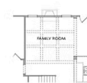
OPT Coffered Ceilings With OPT Media Room -or- Bedroom 5 Above