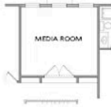
OPT Media Room ilo of Two-Story Family Room