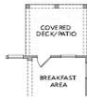
OPT Covered Deck/Patio