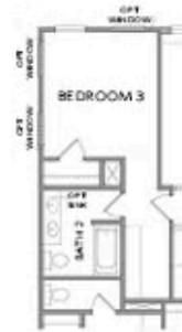
OPT En-Law Suite at Bedroom 3