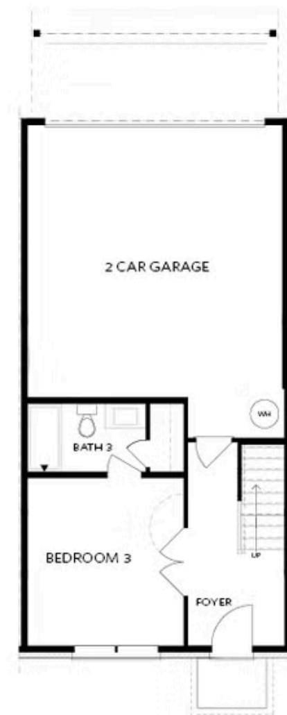
TERRACE Elevations B & C Floor Plan Layout